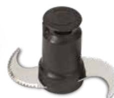
Micro-toothed blade rotor (included)