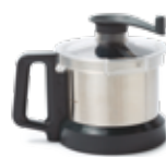
2,6 Lt bowl in AISI 304 stainless steel