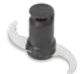
Smooth blade rotor