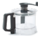
2,6 Lt bowl in transparent copolyester

Prepare multiple menu variations with a series of optional accessories.