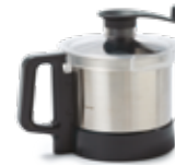
3,6 Lt bowl in AISI 304 stainless steel