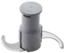
Smooth blade rotor

Choose the perfect cutting blade for your preparation