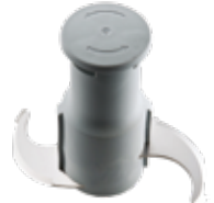
Microtoothed blade emulsifier