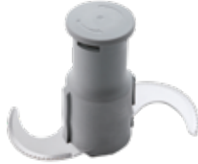
Microtoothed blade rotor